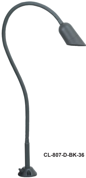
CL-807-D-BK-36 is shown

Warranty: Five (5) year warranty on fixture against manufacturer's defects.