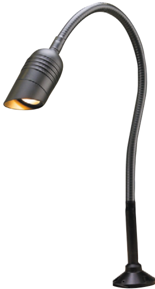
CL-802-D-BK-36 is shown

Warranty: Five (5) year warranty on fixture against manufacturer's defects.