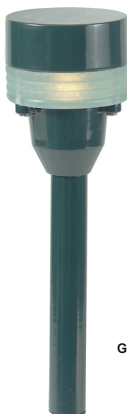
GR- Green finish shown

Limited one (1) year warranty on fixture housing and stem against manufacturer's defects.