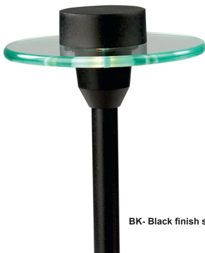
BK- Black finish shown

Wiring: Fixture is prewired with a 3ft 18-2 direct burial cord. Wire connector sold separately Universal connector ( CX-839 ) or silicone filled wire nut ( CX-854 ) is available from Corona Lighting. Mounting Spike: 6" cast aluminum stem with ½" NPT female hub on top Electrical Notes: A remote 12V transformer is required. Options are available from Corona Lighting. Voltage range for 12V halogen lamps are 11V-12.5V Voltage range for LED lamps are 8V-21V. Proper grease/lubricant is suggested on threaded parts during installation process. Warranty: Limited one (1) year warranty on fixture housing and stem against manufacturer's defects.