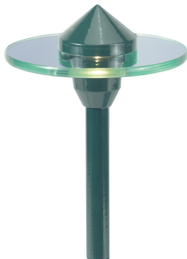
GR- Green finish shown

Limited one (1) year warranty on fixture housing and stem against manufacturer's defects.