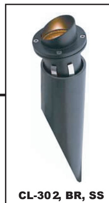
CL-302, BR, SS