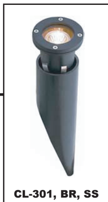
CL-301, BR, SS