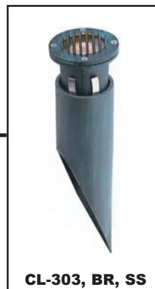
CL-303, BR, SS