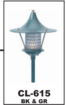
CL-615 BK & GR