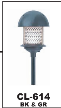
CL-614 BK & GR

Please read carefully before installation SAVE THESE INSTRUCTIONS