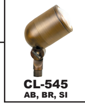
CL-545 AB, BR, SI