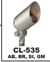
CL-535 AB, BR, SI, GM