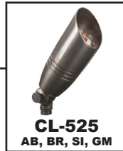
CL-525 AB, BR, SI, GM