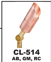
CL-514 AB, GM, RC