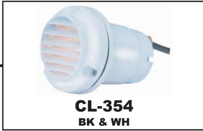
CL-354 BK & WH

Please read carefully before installation SAVE THESE INSTRUCTIONS