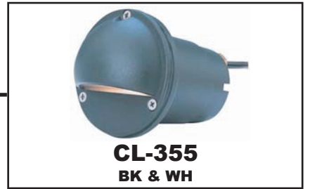
CL-355 BK & WH