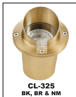
CL-325 BK, BR & NM