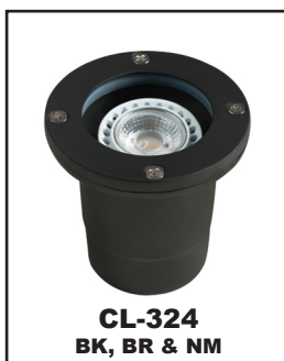
CL-324 BK, BR & NM