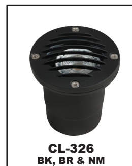
CL-326 BK, BR & NM