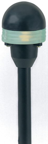
BK-Black finish shown

Wiring: Fixture is prewired with a 3ft 18-2 direct burial cord. Wire connector sold separately Universal connector ( CX-839 ) or silicone filled wire nut ( CX-854 ) is available from Corona Lighting. Mounting Spike: 6" cast aluminum spike with 1/2" NPT female hub on top Electrical Notes: A remote 12V transformer is required. Options are available from Corona Lighting. Voltage range for 12V halogen lamps are 11V-12.5V. Voltage range for LED lamps are 8V-21V. Proper grease/lubricant is suggested on threaded parts during installation process. Warranty: Limited one (1) year warranty on fixture housing and stem against manufacturer's defects.