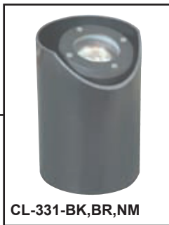
CL-331-BK, BR, NM