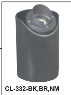
CL-332-BK, BR, NM