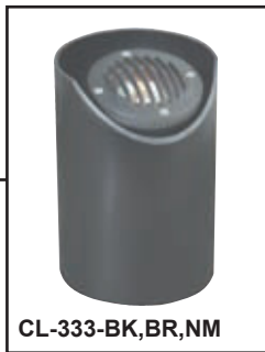
CL-333-BK, BR, NM